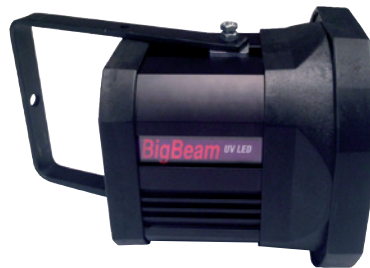
MOUNT WITH MOUNTING YOKE (P/N: F800 & F801)