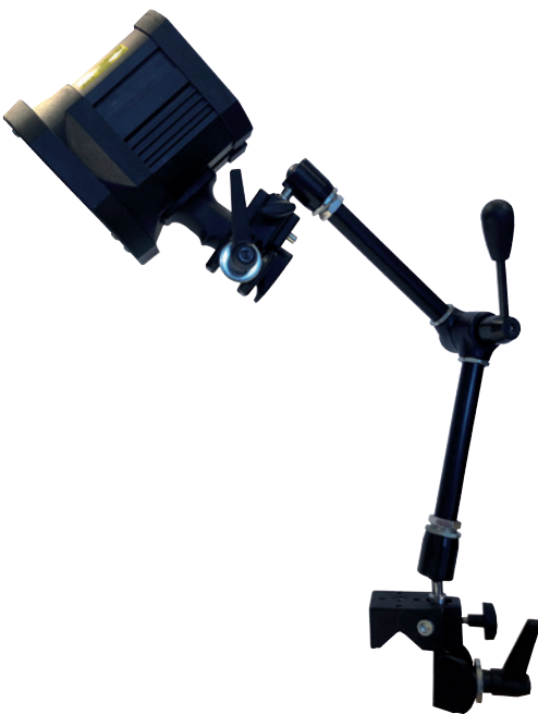
MOUNT ON A FRICTION ARM (P/N: A530)