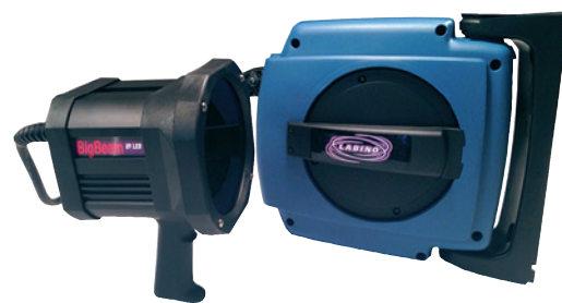
MOUNT ON A CABLE WINDER (P/N: F175)