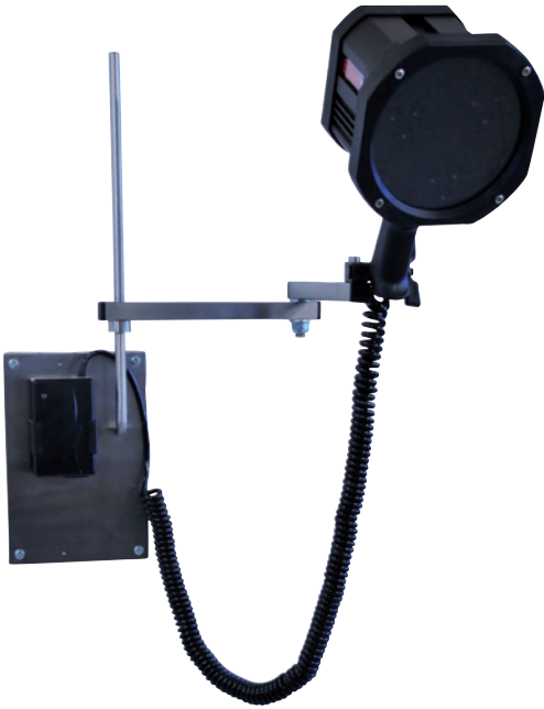
POSITION ON A FLEXIBLE ARM (P/N: A536)